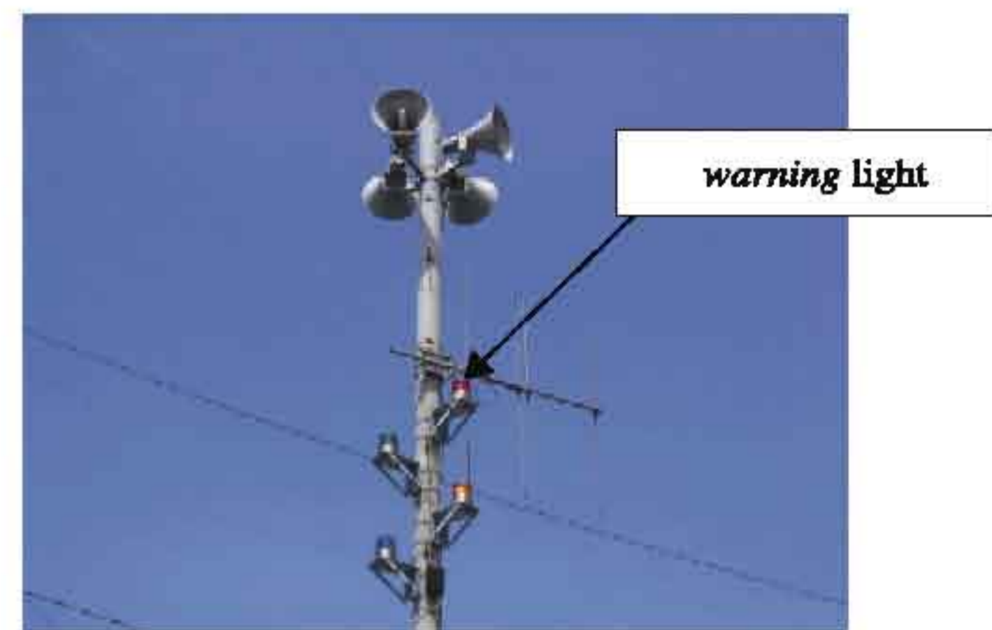
<public address system>

If the alarm is on the broadcast, put on your hazard mask and evacuate to safer places immediately.